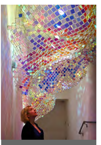
Art installations created by Artists in Residence interpret energy technologies, simultaneously inspiring the viewer, connecting art with science and product development.