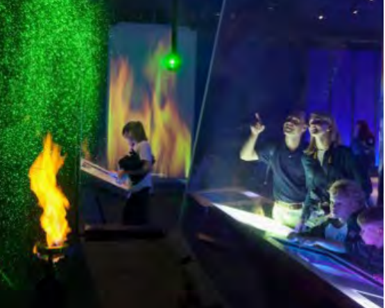
An Interactive Showcase highlights and demonstrates the of state-of-the-art technologies at work and under development in the Center. Through hands-on exhibits, visitors learn about energy and explore curated stories of real innovators and real technology.