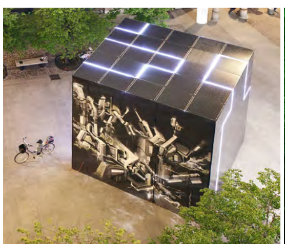
A striking structure creates an iconic entry to the building. The exterior surface of this entry vestibule is comprised of configurable digital walls to mimic the energy consumption, generation, flow, and KPIs of the entire campus in a 3D model , making a strong statement that the Center is not just a building, it is a building with a brain.

Engaging the community is essential to the mission of the Center. The innovations that will originate here are intended to better the world, and that process begins with community participation. Ohio State faculty, staff and students, researchers, entrepreneurs, artists and local industry leaders will make the Center Columbus' new home for public discourse around energy, with public events, TED Talk-style presentations, demonstrations, receptions, and conferences focusing on issues in the energy and digital technology sectors. In cooperation with the local community organizations, the Center will include a dedicated arts program to facilitate artistic design to seep into the innovative products of the designers and developers. The Center will stand apart from other research facilities and innovation centers by offering a public showcase that explores energy issues, active research projects and technology through public events as well as exhibit-style interactive experiences that promote understanding about the state of the industry and the future of innovation.