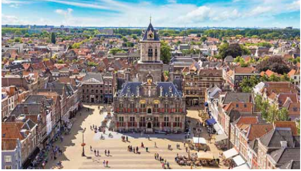
Old Town, Delft