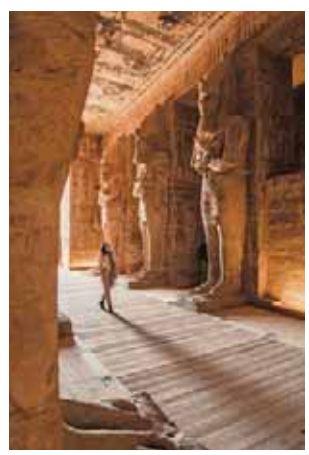
Temple of Ramses II, Abu Simbel

Your Egyptologist, a handpicked, knowledgeable, licensed expert, opens your eyes to the depth and breadth of the country's history and makes Egypt come to life for you at every stop throughout your journey.