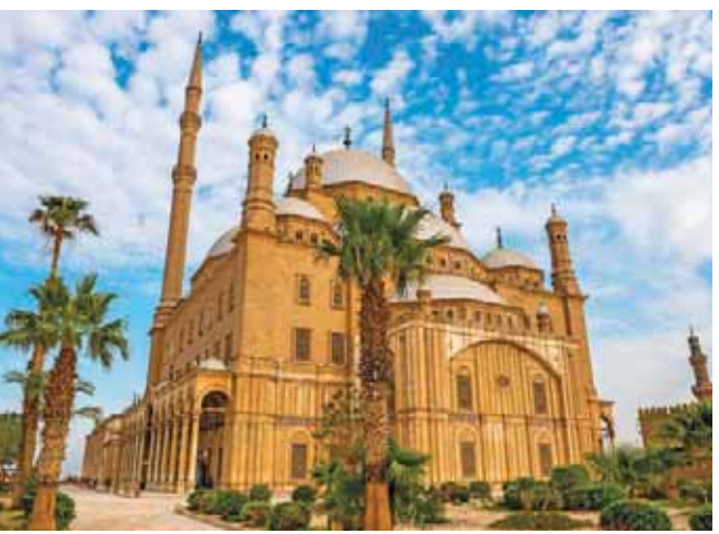
Mosque of Mohammed Ali, Cairo