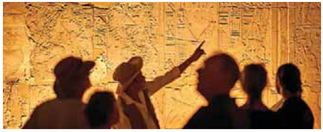
Exploring with Egyptologist

Please note: Program-specific terms and conditions are available at https://ohst.ahitravel.com/destinations/1822A?schoolld=124. You can also request a copy from our travel experts. Any payment to AHI Travel constitutes your acceptance of the terms and conditions set out therein, including but not limited to the cancellation terms.