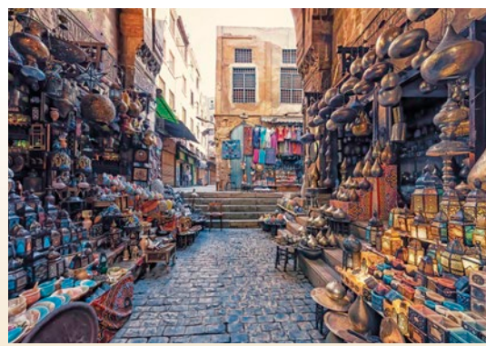
Khan el Khalili bazaar, Cairo

Luxor's West Bank — The Valleys of the Kings and Queens. Explore this spellbinding