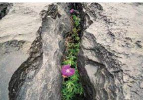
Flora among the limestone, Burren