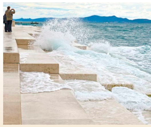
Sea organ, Zadar

Hvar Island . Uncover the sights of sunny Hvar, including its Renaissance cathedral, a community theater and a convent dedicated to