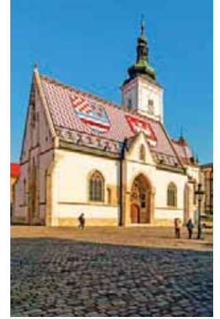
St. Mark's Church, Zagreb

Knowledgeable Lecturers deepen your appreciation for the region and its history, culture and current events.