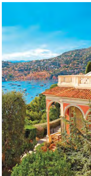
View of the Côte d'Azur from Villa Ephrussi

Knowledgeable Lecturers deepen your appreciation for the region and its history, culture and current events.