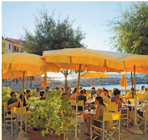
Seaside dining in Vernazza