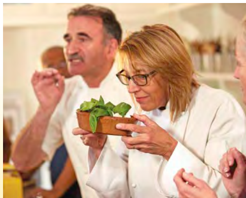
Italian cooking lesson

Cinque Terre. Few places will touch your heart like this patchwork of villages tumbling to the