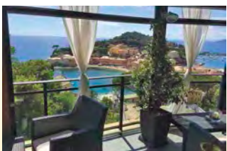
Hotel Vis a Vis | Sestri Levante