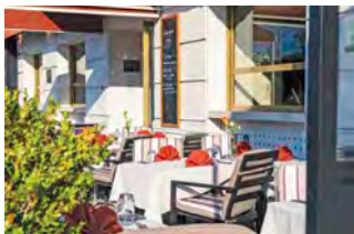
Hotel Aston La Scala | Nice