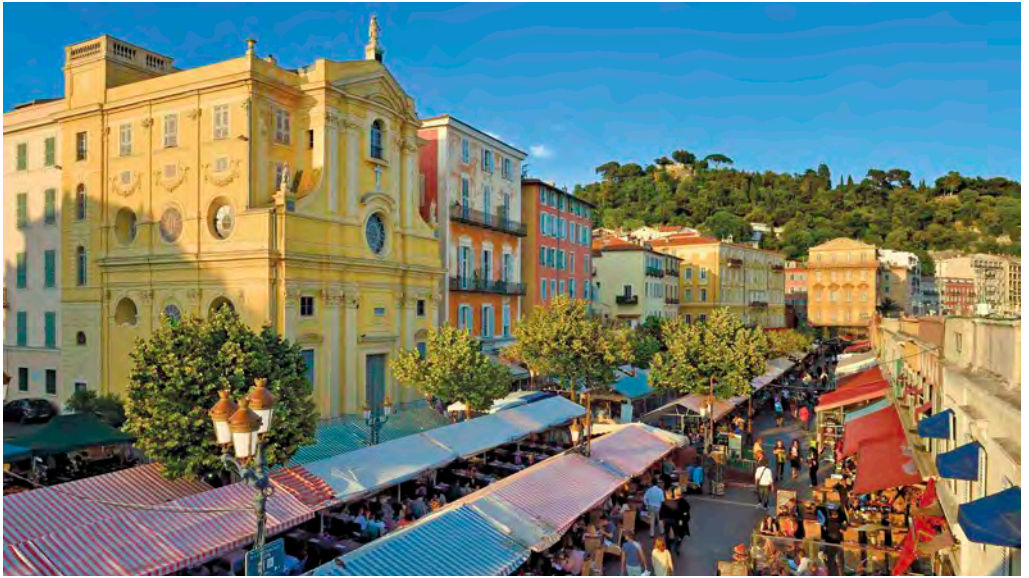
Cours Saleya, Nice