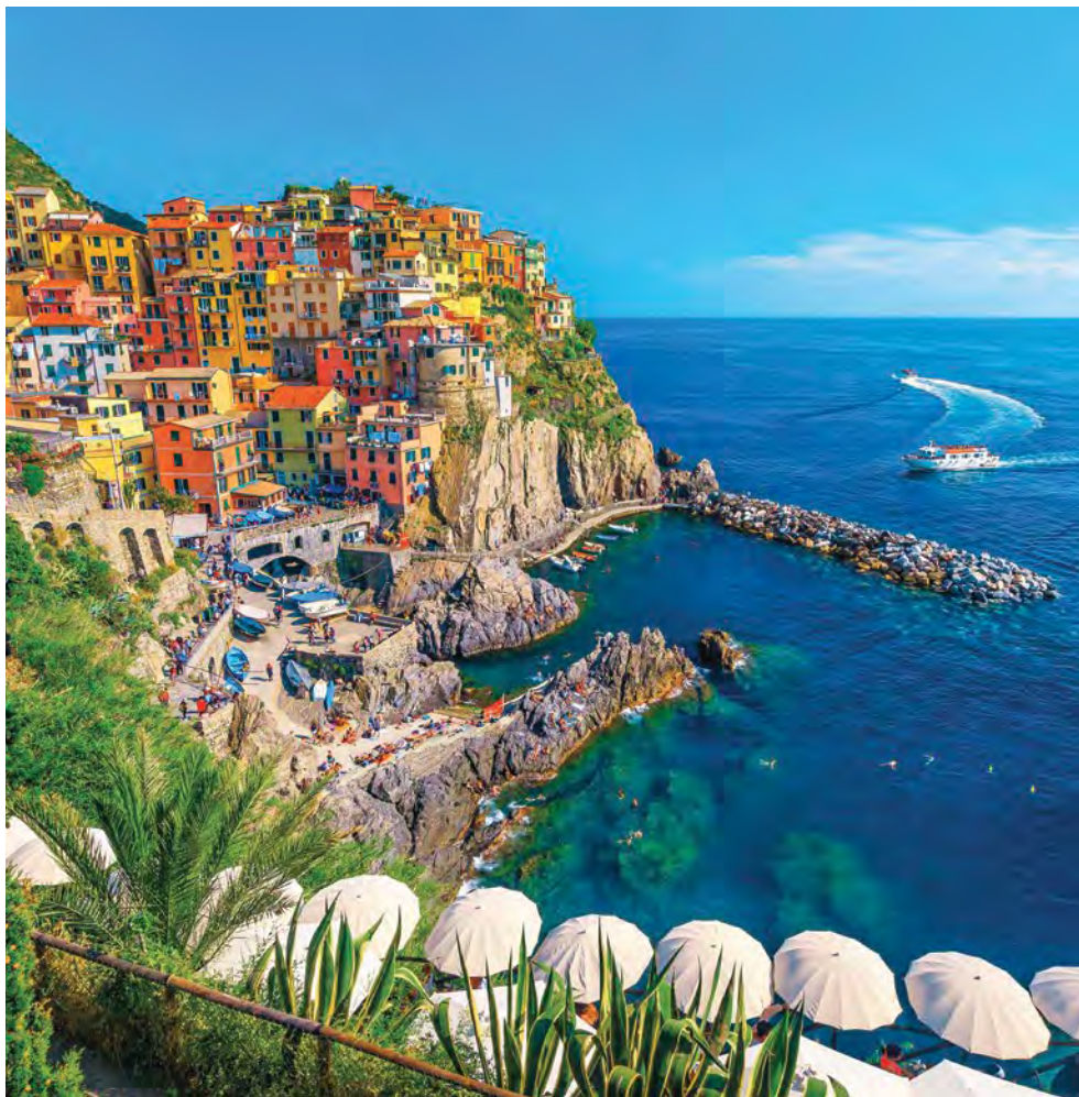
Manarola, Cinque Terre