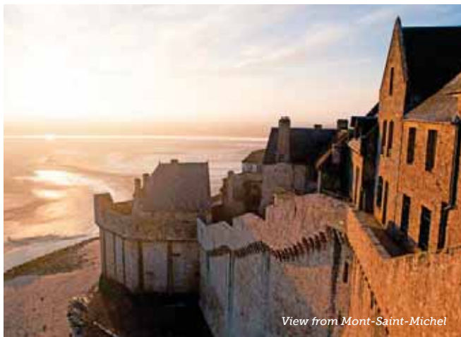
View from Mont-Saint-Michel