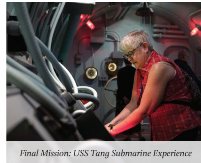
Final Mission: USS Tang Submarine Experience