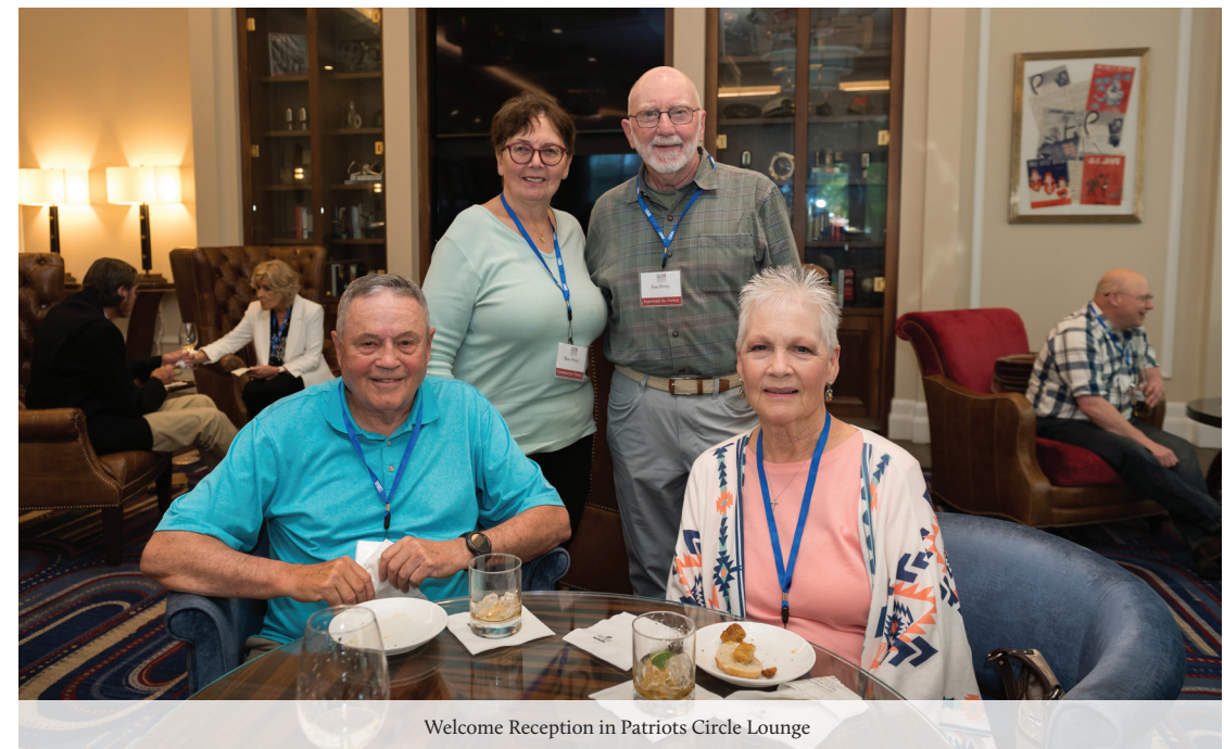
Welcome Reception in Patriots Circle Lounge