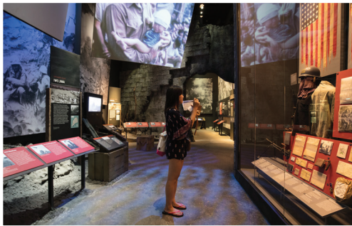
Road to Berlin galleries