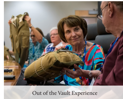
Out of the Vault Experience