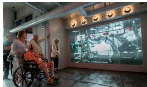
Early access to the galleries