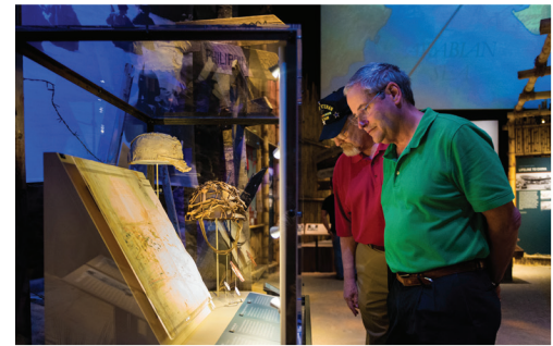
Road to Tokyo galleries