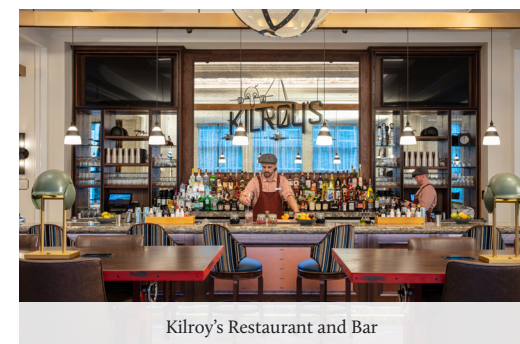
Kilroy's Restaurant and Bar

Worry-free booking! Full refund until one week prior to the tour. Call 1-877-813-3329 X 257