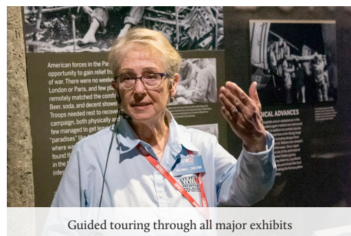
Guided touring through all major exhibits