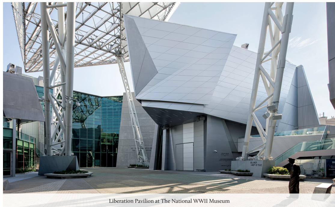
Liberation Pavilion at The National WWII Museum