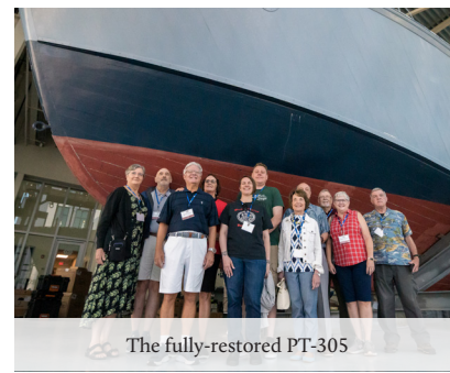
The fully-restored PT-305