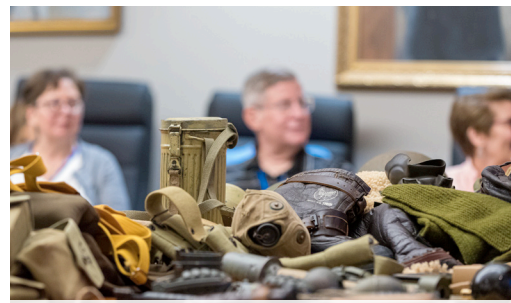
Out of the Vault Experience