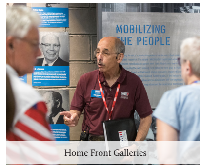
Home Front Galleries