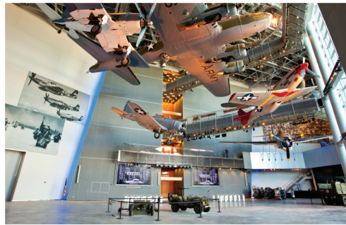
US Freedom Pavilion: The Boeing Center