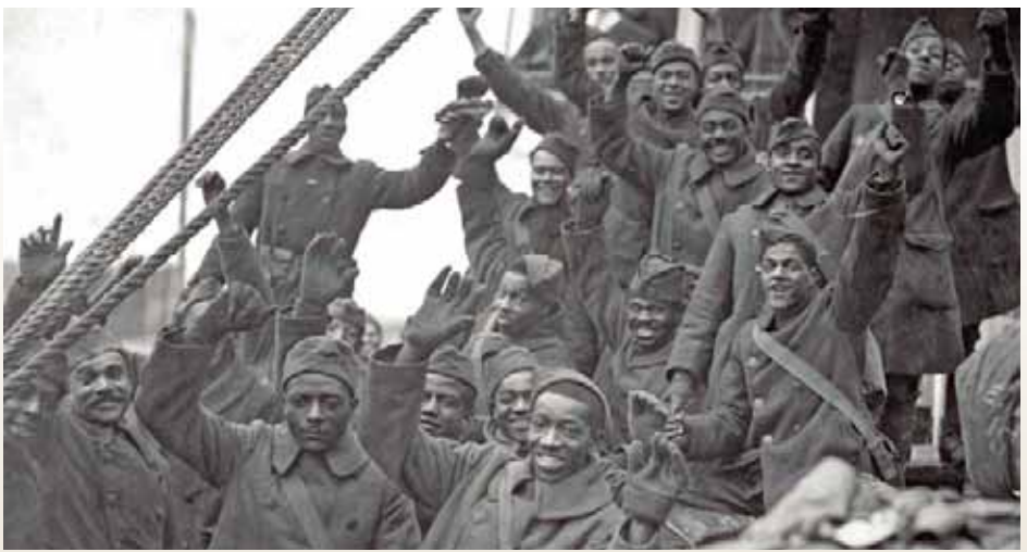
369th Infantry Regiment