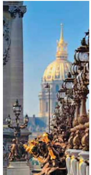
Pont Alexandre III

Knowledgeable Lecturers deepen your appreciation for the region and its history, culture and current events.