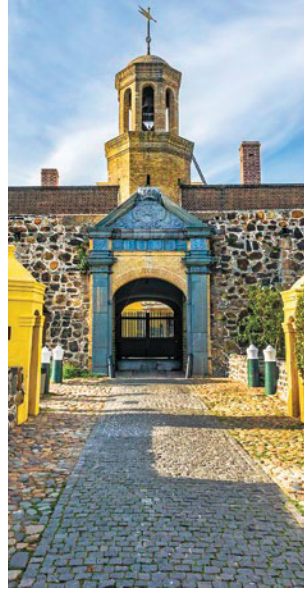
Castle of Good Hope, Cape Town

Knowledgeable Lecturers deepen your appreciation for the region and its history, culture and current events.