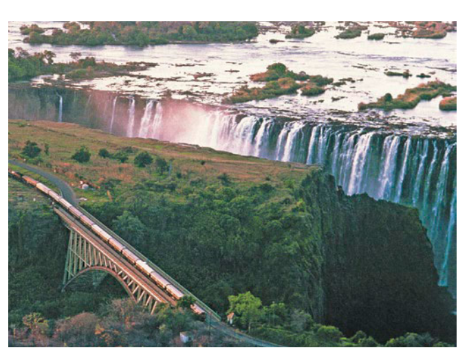
Rovos Rail, Victoria Falls