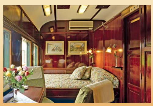
Deluxe Suite with a double bed and a lounge area

Discover the glamourous Golden Age of train travel aboard the luxurious Rovos Rail. Revel in the incredible attention to detail and lavish offerings while riding in vintage carriages, restored to mint condition and impeccably appointed. Spend your days in the Observation Car or mingle with your fellow travelers in the lounge. On-board chefs prepare traditional dishes and regional specialties with only the finest of ingredients. Enjoy sumptuous breakfasts each morning and delicious three-course lunches and dinners, featuring fine South African wines.