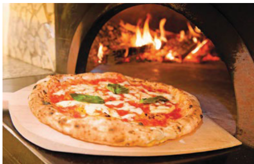
Above: Neapolitan pizza | Below: Olive oil & cheese