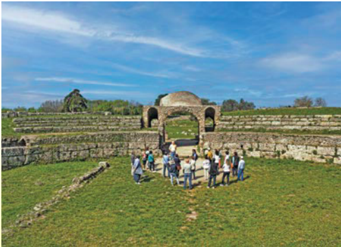
Below: Amphitheater, Paestum | Above: Amalfi

Naples & the Museo Archeologico Nazionale. Energetic Naples, the capital city of Campania, welcomes visitors with a vivacious spirit. Gain insight into the ancient world at the Museo Archeologico Nazionale. The museum's galleries boast one of the largest collections of Greco-Roman artifacts in the world. Continue on a panoramic tour of Naples, taking in sprawling views of the city and the Bay of Naples from atop Posillipo Hill. Note the landmarks of Castel