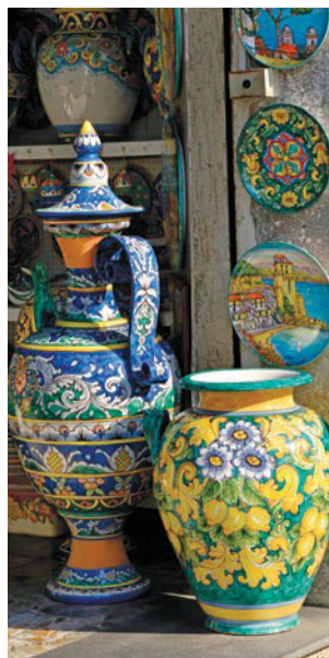
Pottery, Vietri sul Mare

Knowledgeable Lecturers deepen your appreciation for the region and its history, culture and current events.