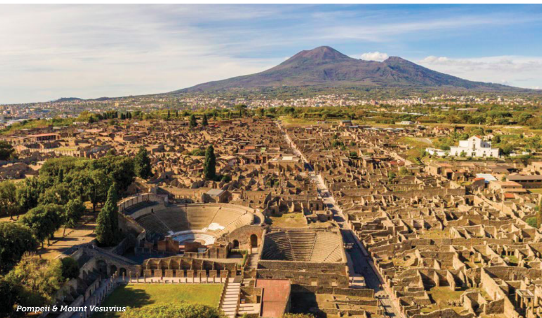
Pompeii & Mount Vesuvius

Nuovo, San Francesco di Paola, Teatro di San Carlo and Piazza del Plebiscito.