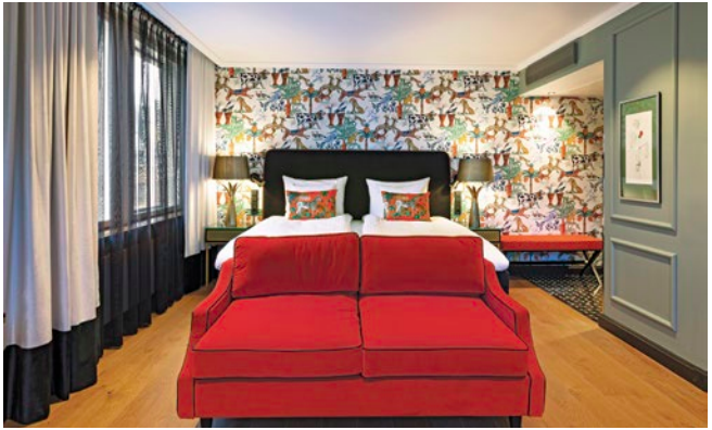
Hotel U14 | Helsinki