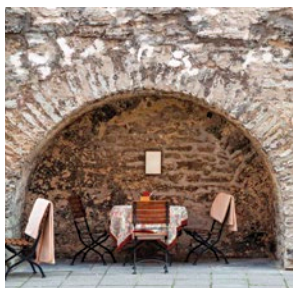
Old Town, Tallinn