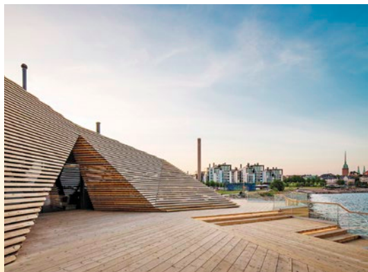
Löyly Sauna, Helsinki

Spend time getting settled in your cozy cabin and checking out the Village's lovely environs. Savor a tasty dinner in the Village's dining room.