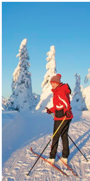
Exploring at Northern Lights Village