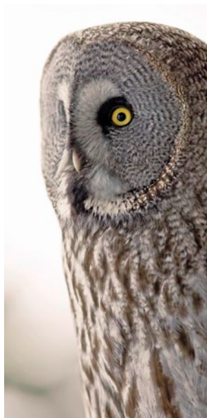
Great Grey Owl, Lapland