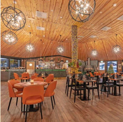
Dining room, Northern Lights Village