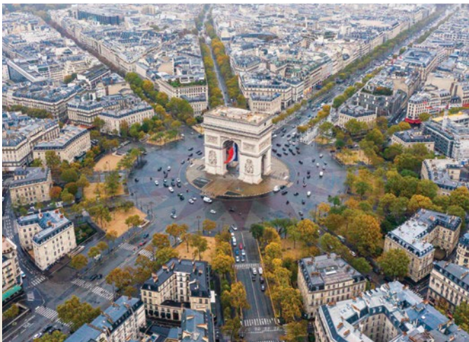
Arc de Triomphe and the Champs-Élysées

After World War I, Parisians rebuilt their lives as jazz, a new sound introduced to France by African American soldiers, filled the air. Lively and unique, jazz was the perfect soundtrack to a fresh start, both for French music fans and African American troops. The 369th Infantry Regiment is credited with transforming Paris' cultural scene. The unit became famous for its bravery and its band, led by Lieutenant James Reese Europe and Sergeant Noble Sissle. Attached to the French army because U.S. forces were still segregated, the 369th Infantry was brave in battle. Nicknamed the "Harlem Hellfighters" by the Germans, the 369th and several individual soldiers were singled out for France's highest award for valor. Off the battlefield, the band boosted morale across France with music that would soon fill Parisian clubs. For two decades, Montmartre hosted the flourishing jazz community, which drew African American musicians and club owners from the U.S. Several musicians left Paris during Germany's World War II occupation, but the city's love of jazz never wavered. Jazz surged again after the war with great African American musicians leading the way, and the music still delights concertgoers today.