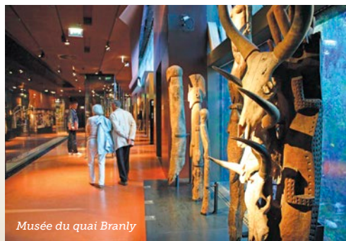
Musée du quai Branly

Free Time: After a group lunch, indulge in fine