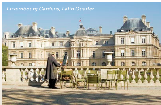
Luxembourg Gardens, Latin Quarter