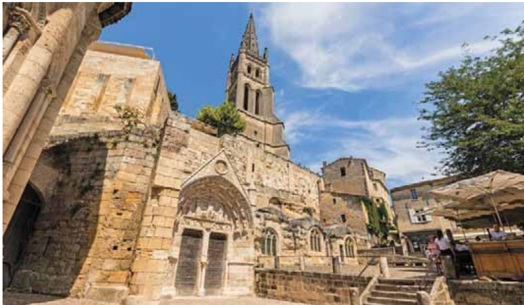
Monolithic Church, Saint-Émilion