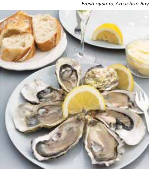
Fresh oysters, Arcachon Bay