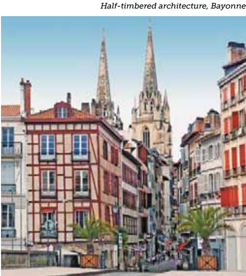
Half-timbered architecture, Bayonne