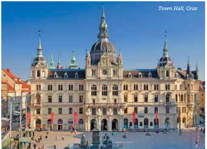
Town Hall, Graz