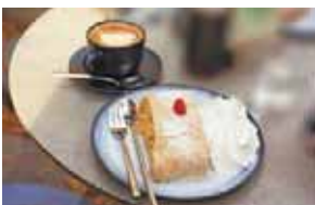
Apple strudel, Graz