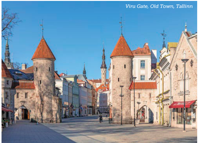
Viru Gate, Old Town, Tallinn