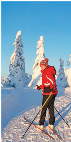
Exploring at Northern Lights Village