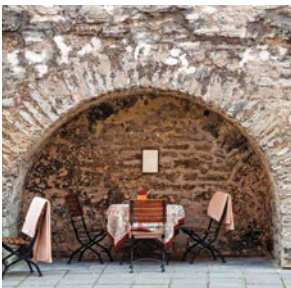
Old Town, Tallinn

Historic Center (Old Town) of Tallinn, Estonia