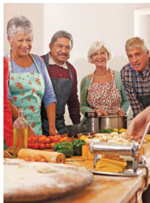
Piedmontese cooking class