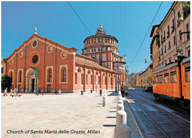
Church of Santa Maria delle Grazie, Milan