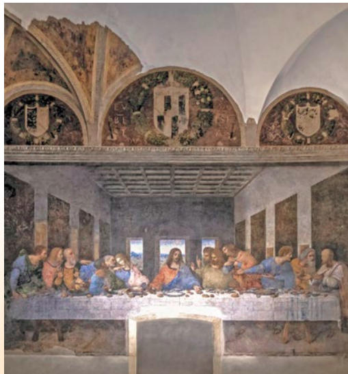
Leonardo da Vinci's "The Last Supper"